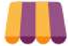
Point of Sale